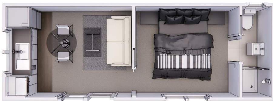
Overhead view of cabin