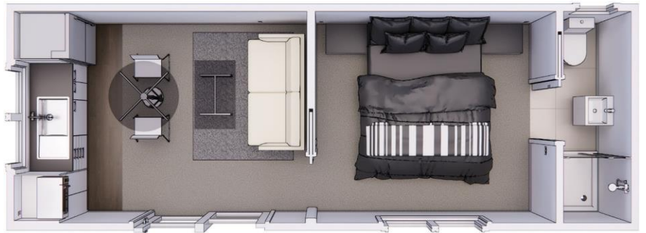
Overhead view of cabin