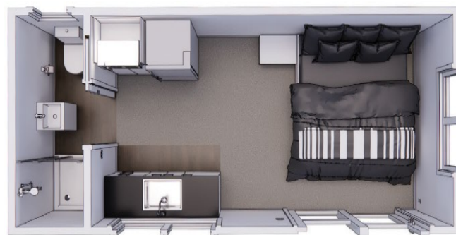
Overhead view of cabin